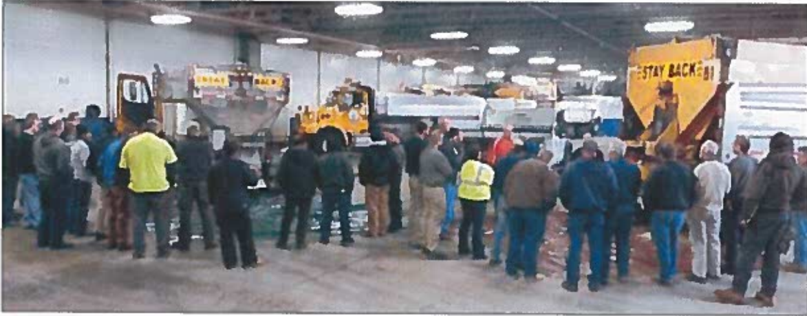
Calibration Workshop Attendees, November 18 th , Wheaton, IL

The general agenda for the morning included information on calibration and why it is important then hands on demonstrations for an open loop (no compensation for changes in vehicle speed), closed loop (compensation for vehicle speed) and electronic system. Participants rotated through the "stations" in two groups.